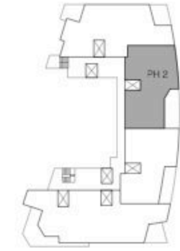
LOWER PENTHOUSE KEYPLAN