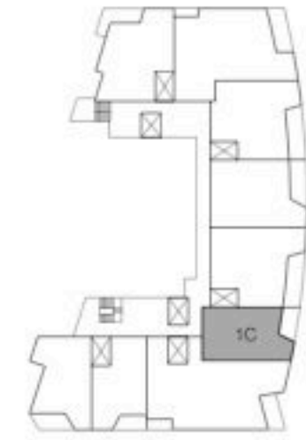
TOWER RESIDENCES KEYPLAN