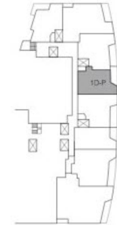
PODIUM RESIDENCES KEYPLAN